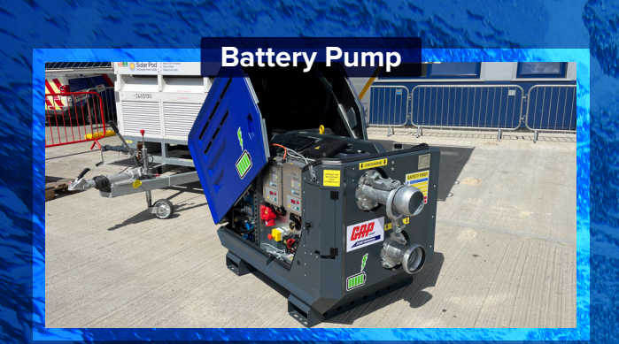
Ease of portability with silent operations

GAP is committed to sustainability by sourcing locally, reducing carbon footprints, and providing environmentally friendly solutions.