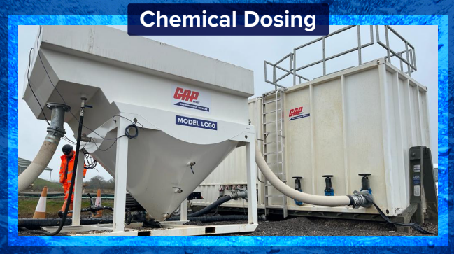
Advanced safety features and application accuracy