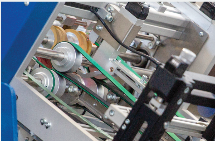
System automation and integration